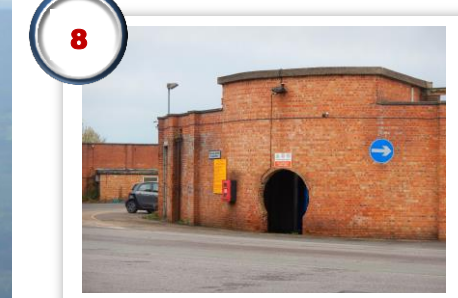
Engine Running Pens