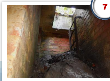
Entrance to CO's Battle Headquarters and Control Room