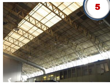
WWII - T2 Aircraft Hangar