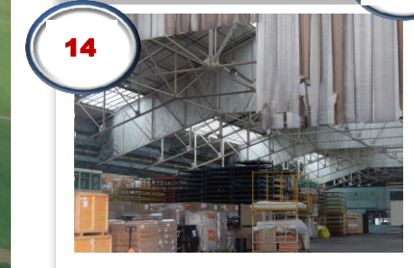
Type A1 Hangars x 3