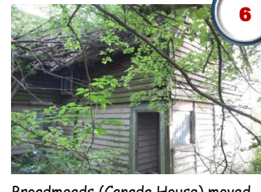
Broadmeads (Canada House) moved across the airfield in 1942