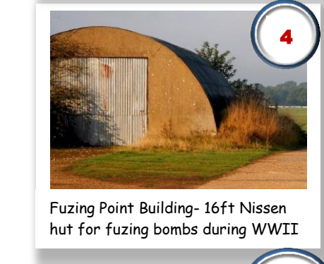
Fuzing Point Building- 16ft Nissen hut for fuzing bombs during WWII