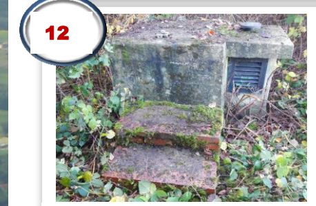
Royal Observer Corps - entrance