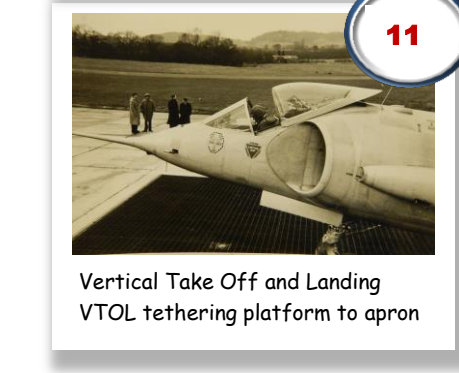
Vertical Take Off and Landing VTOL tethering platform to apron